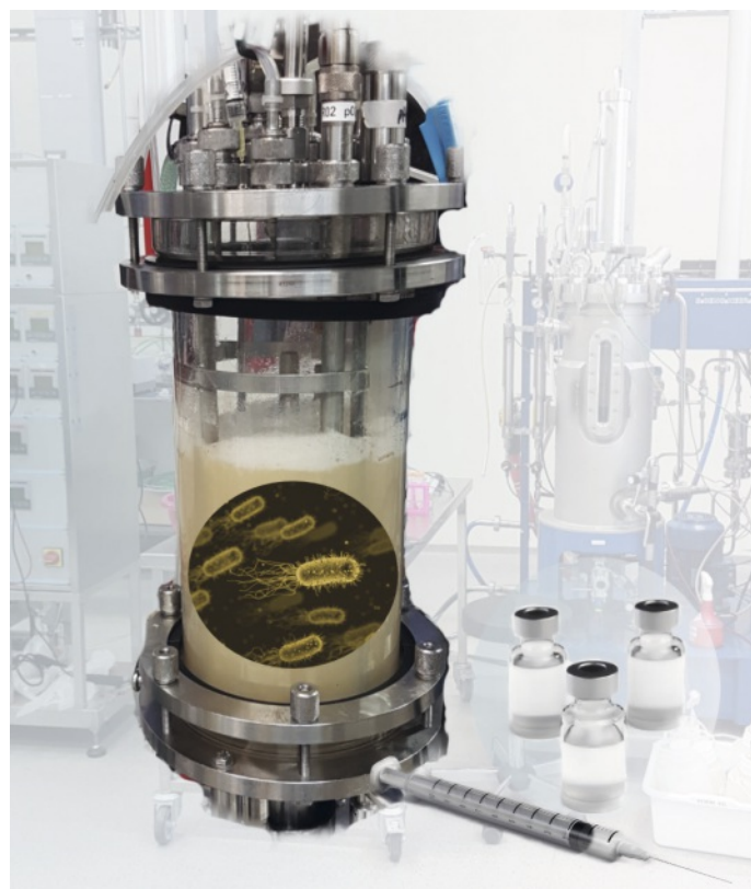
Fig. 1. Lab scale bioreactor with an Escherichia coli K12 culture. This bacterial strain is used to produce injectables such as antibiotics that need to be endotoxin-free.